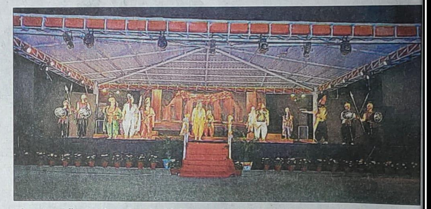
The grand finale show fused with live music was the highlight of the evening

Addressing the gathering, the chief guest congratulated the members of the school team for their hard work. He said that every student should